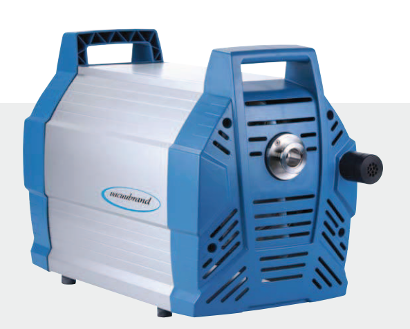
ME 16 NT 16.4 m<sup>3</sup>/h 70 mbar